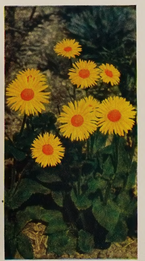
DORONICUM, Mme. Mason

Make it a point to start at least one or two new perennials in your garden each season, and soon you will have something worth while. Plan ahead, keeping color, height and blooming season in mind.